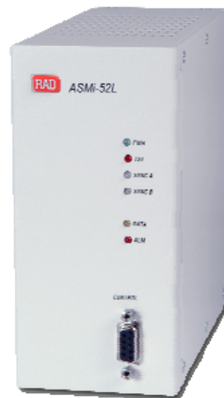
Rail-mount Metal Enclosure

Dedicated managed SHDSL modem for 2-wire and 4-wire service over any copper infrastructure