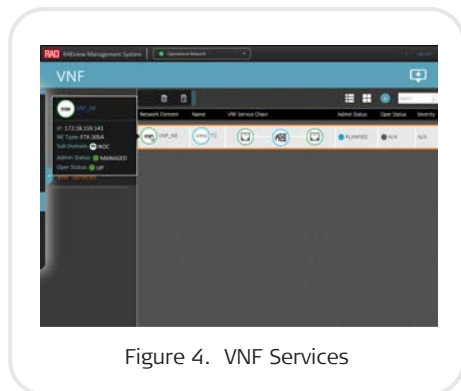
Figure 4. VNF Services

Service Manager. This module is designed to minimize the effort of setting up a multi-service Carrier Ethernet network. RADview-Service Manager enables easy wizard-based E-Line, ELAN and E-Tree Ethernet service creation, service activation tests (Y.1564), monitoring and SLA assurance for networks based on the RAD product family.