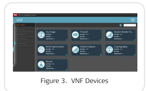
Figure 3. VNF Devices