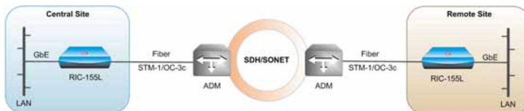
Figure 2. Point-to-Point Ethernet Private Line over SDH/SONET

Temperature: 0 to 50°C (32 to 122°F) Humidity: Up to 90%, non-condensing