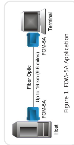
Figure 1. FOM-5A Application